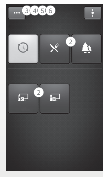
*Available for ReSound LiNX<sup>2</sup> 9 and ReSound ENZO<sup>2</sup> 9. **Available for ReSound LiNX<sup>2</sup> and

1. Adjust and mute volume for both hearing aids or for each hearing aid individually.